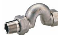
RTD-CB back-flow restrictor

The Renovation+ Solution makes it possible to renovate old, one-pipe systems and improve indoor comfort, reduce overheating in buildings, and reduce energy costs. Please contact your local Danfoss Company for more information on the Renovation+ Solution.