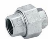
RTD-BR bypass restrictor